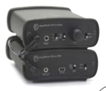
The Micro Stack

1. Plug the mini-to-mini cable into the line input of the Amp and line output of the DAC. Don't forget to select the appropriate power source on each unit.